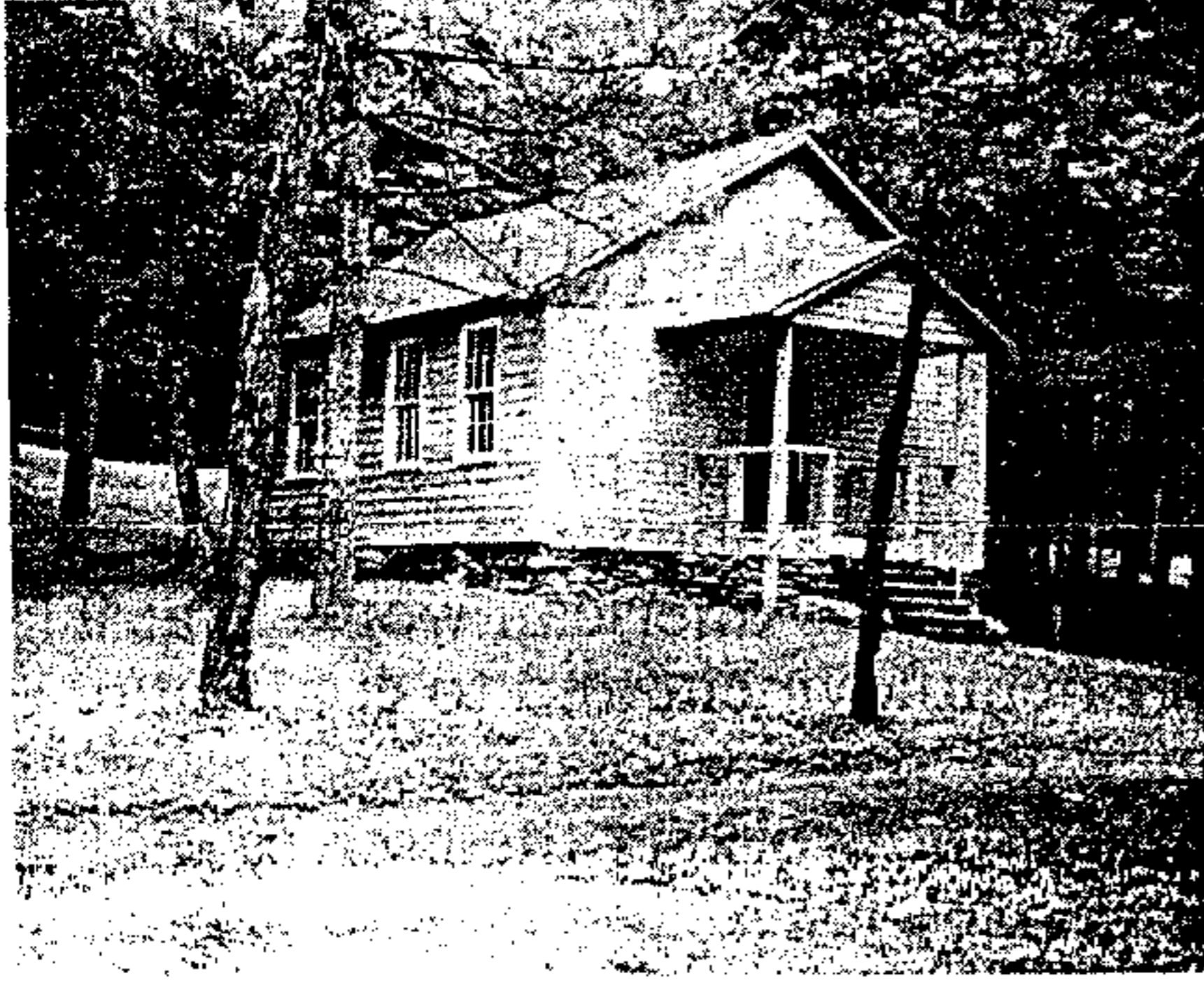
Pleasant Vale School, YMCA Camp Horseshoe, Rt. 2, St. George, W.Va., 1985, school restored, reopened.